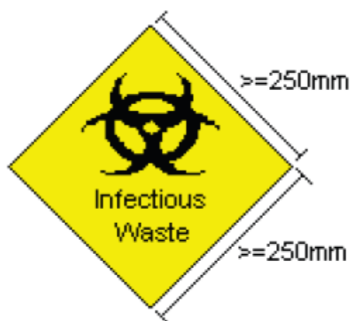
Figure 2 – infectious waste placard